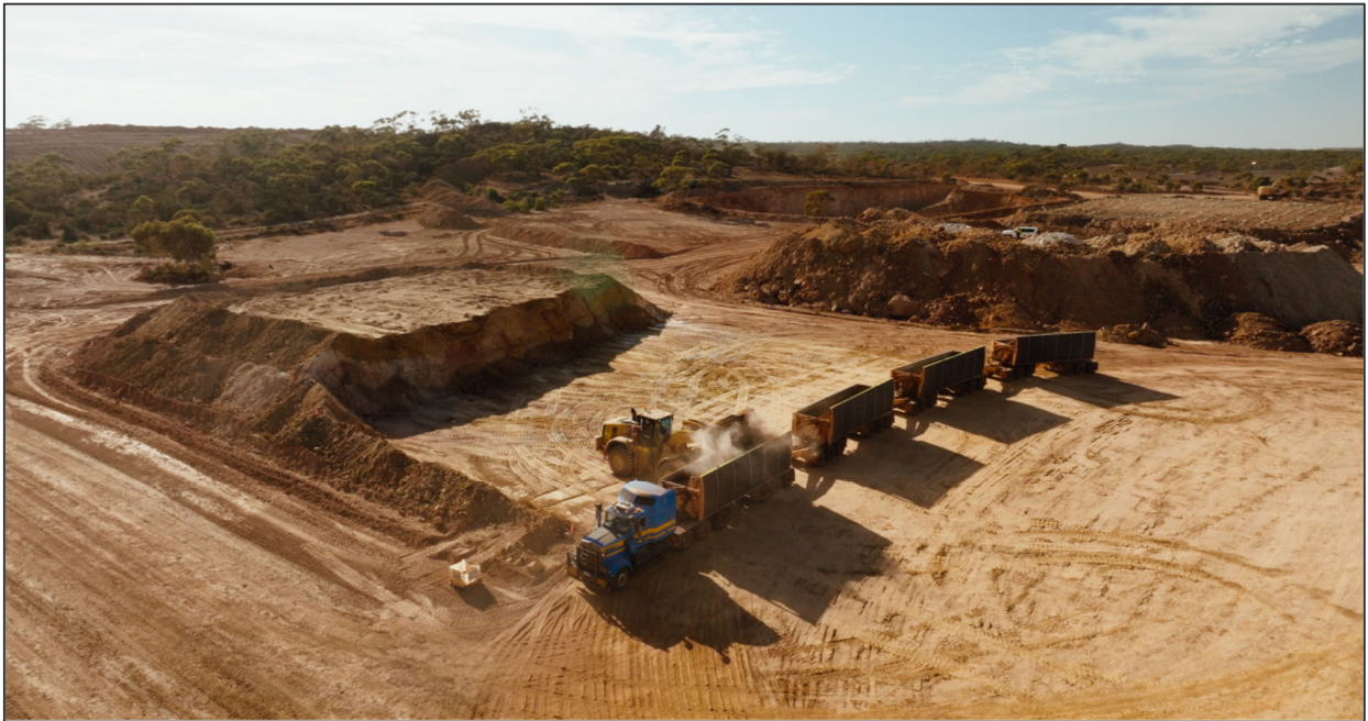
Figure 3: Loading ore at Boorara to transport to the Paddington Mill