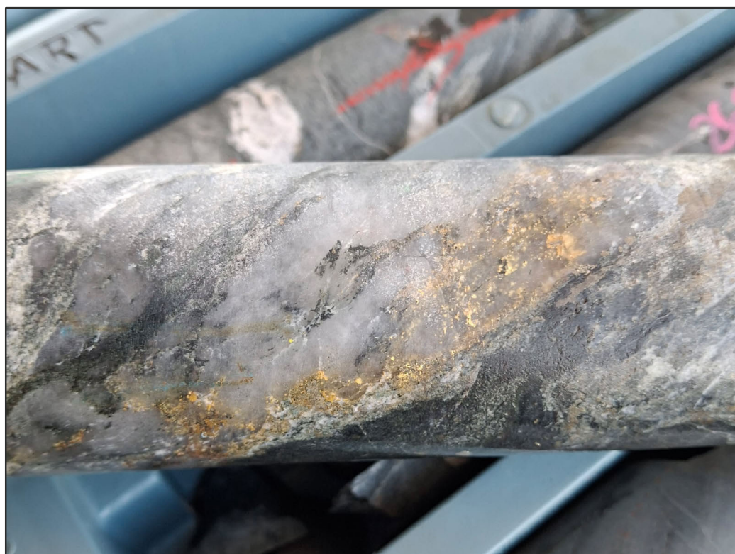
Figure 6: Visible gold in a quartz vein at 259.3m from hole 25HBBD024. The interval grades 0.3m @ 5848g/t Au from 259.17m (refer Table 1) 1 . Core width is NQ2 and ≈ 50.5mm in diameter for scale

Coarse grained visible gold in drill core has been observed, hosted in quartz carbonate veining within sheared basalt or, alternatively, associated with a distinctive garnet-rich diorite that has intruded along the Burbanks Shear. The ultra-high grade of 5,848g/t Au over 0.3m from 259.17m (Figure 6) within an overall significant intercept of 0.96m @ 1,762g/t Au from 259.17m in (25HBBD024) 1 helped confirm the exceptional potential for down dip extensions to the high-grade gold mineralisation. This key intercept provides compelling evidence for immediate resource expansion potential in this critical infill area.