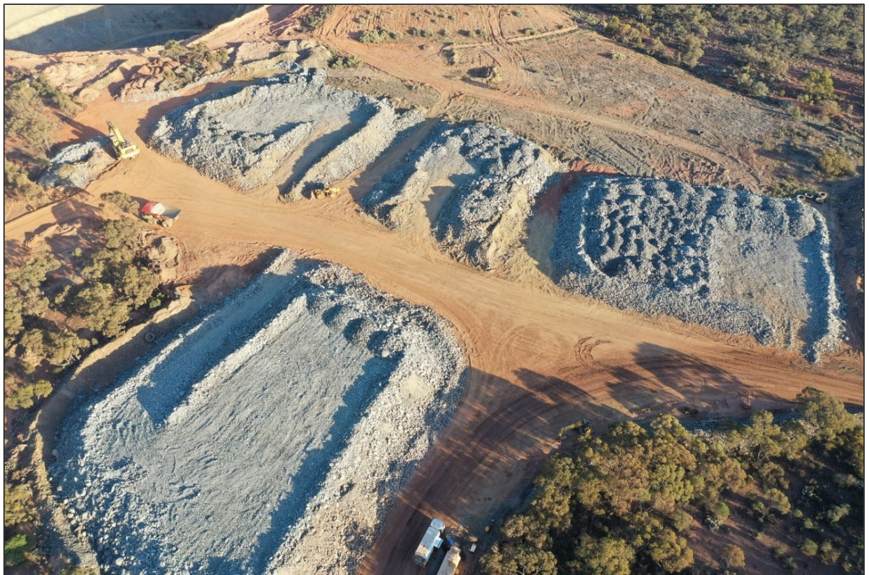
Figure 4: Ore on the Phillips Find ROM pad