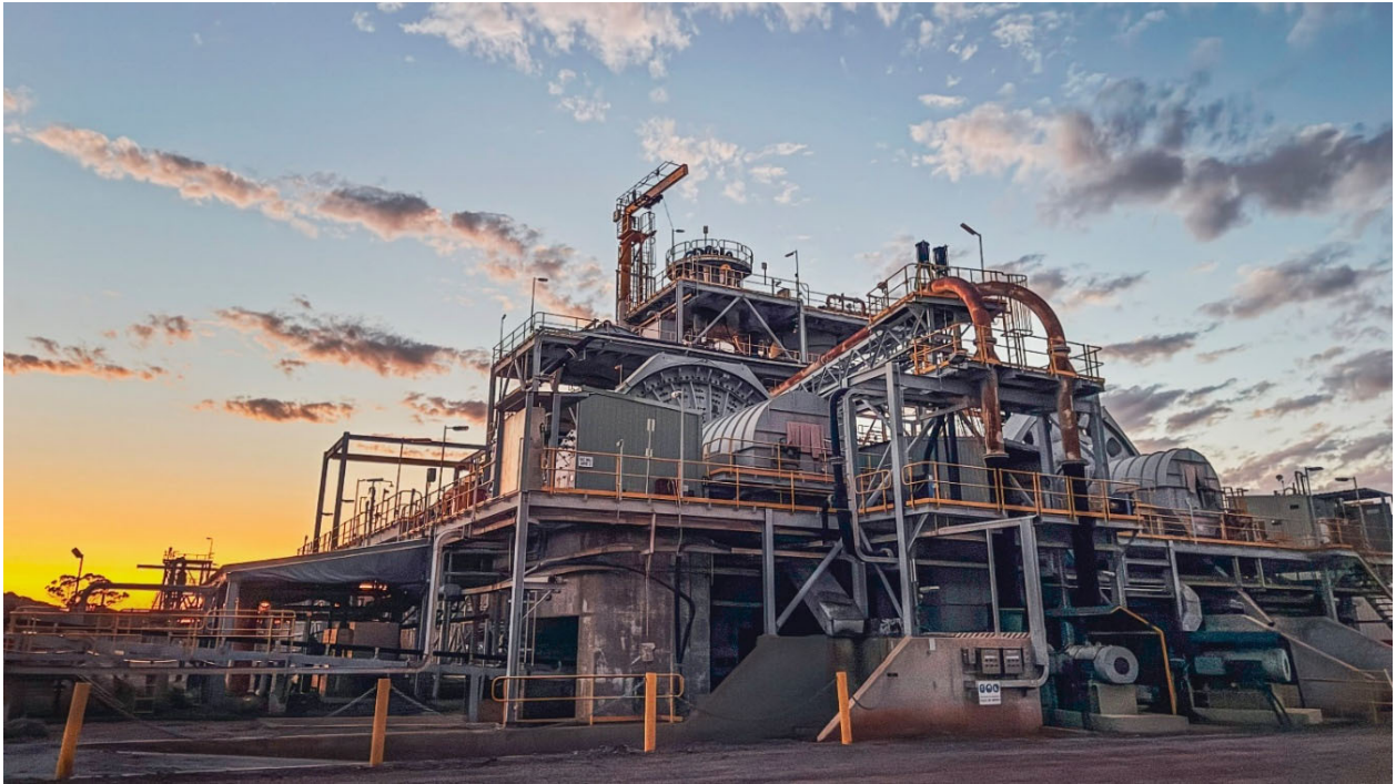
Figure 2: Black Swan Project – Existing SAG & Ball Mills