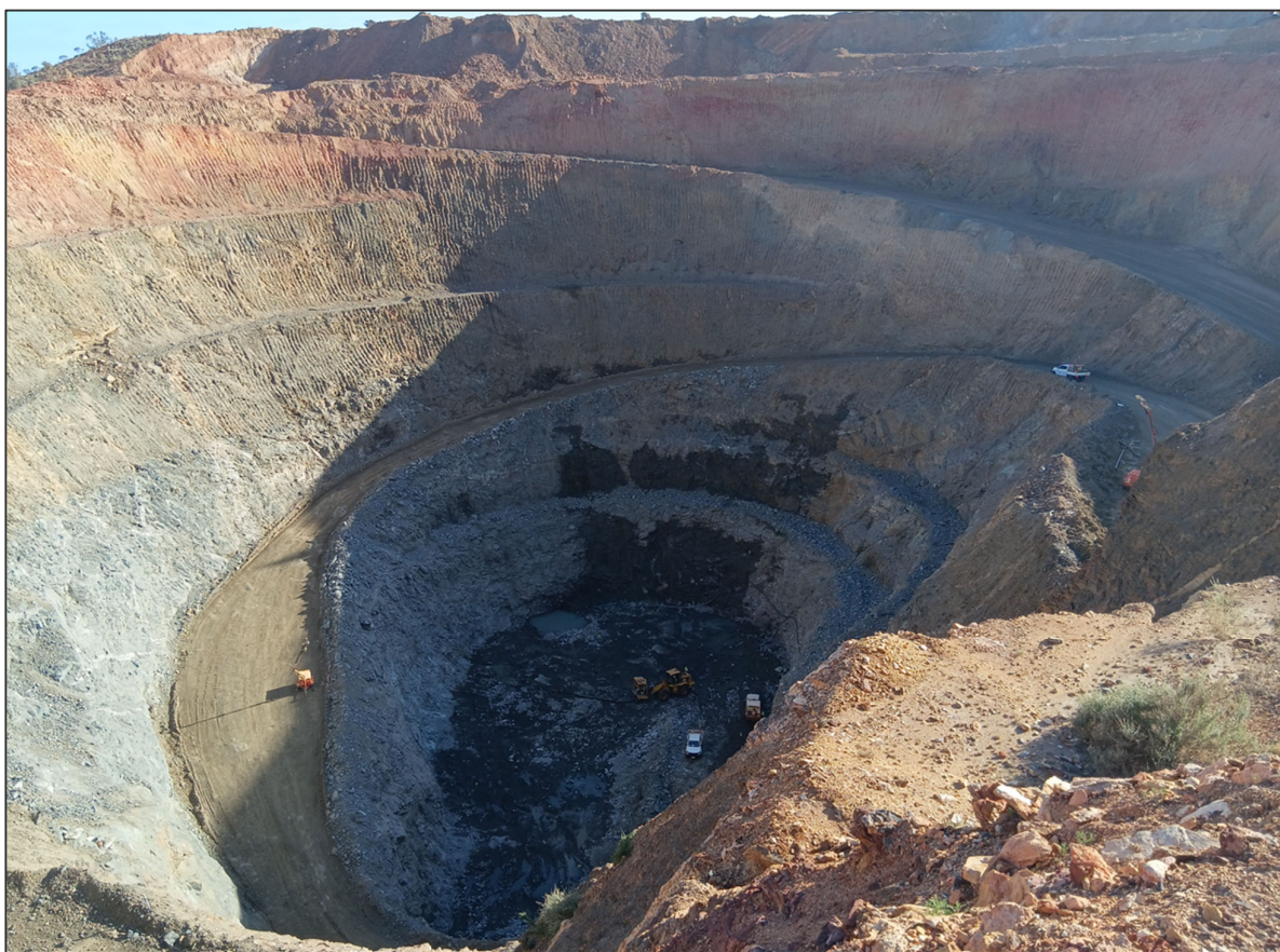
Figure 5: Mining the Newminster pit at Phillips Find