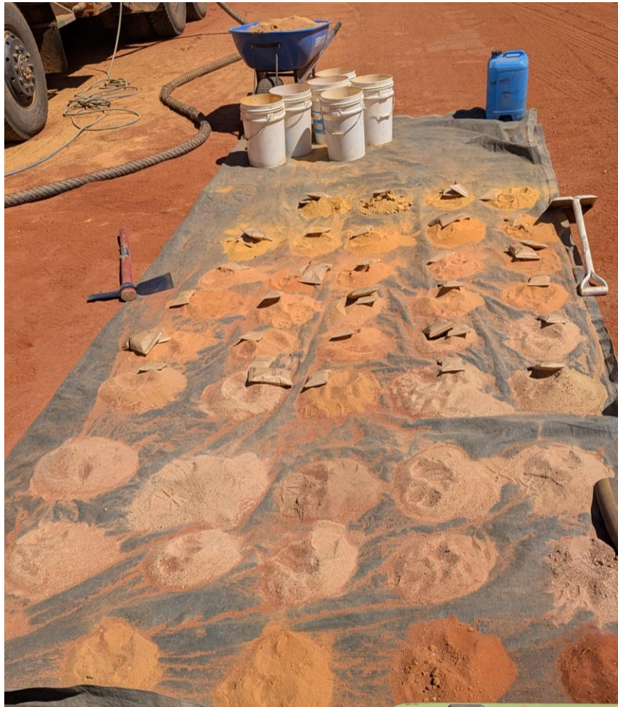
Figure 3: Geochemical sampling of clays below soil and sand cover in drillhole SBDH25093