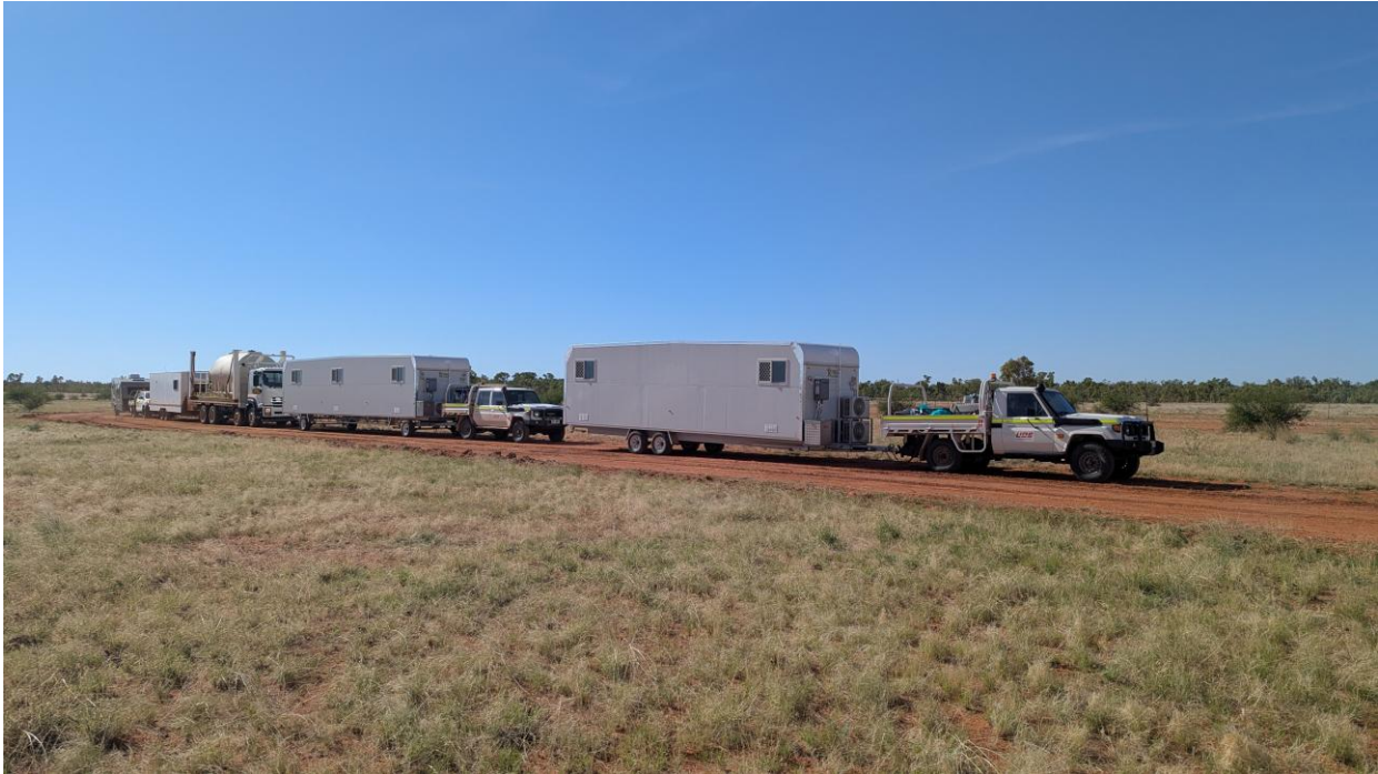
Figure 2: Demobilisation of camp and drilling equipment

Phase 1 drilling at the Company's Sybella-Barkly Project is now completed with a total of 2,723.7 metres completed across 63 holes with all sites fully rehabilitated pending post wet season inspections and all drilling and camp equipment removed from sites.