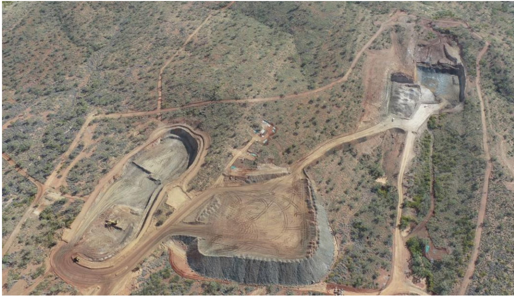
Figure 4 – Overhead of Golden Mile Complex, Comstock pit to the left and Shamrock pit to the right

Only 600 metres to the north of Mt Freda, the Golden Mile complex hosts a series of parallel shear-hosted lodes historically worked by underground and open pit methods. Modern drilling in 2022 returned high-grade intercepts that confirm the continuation of mineralisation at depth and along strike. With Shamrock and Comstock pits already established, Golden Mile represents a low-cost, high-impact satellite to Lorena, offering immediate resource definition and development upside.