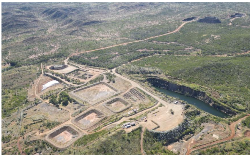
Figure 3 – Overhead of Mt Freda Complex, including open pit and proposed VAT processing

Mt Freda is one of Cloncurry's most recognised historic gold mines, producing significant ounces in the late 1980s and early 1990s when open pit mining exposed high-grade shoots within brecciated quartz-carbonate lodes. Subsequent operators including Ausmex and Tombola defined JORC-compliant resources and drilled extensions showing the system remains open along strike and at depth. Flanked by the Shamrock and Comstock pits on granted MLs, Mt Freda forms the backbone of near-term restart potential, with haulage roads and infrastructure already in place.