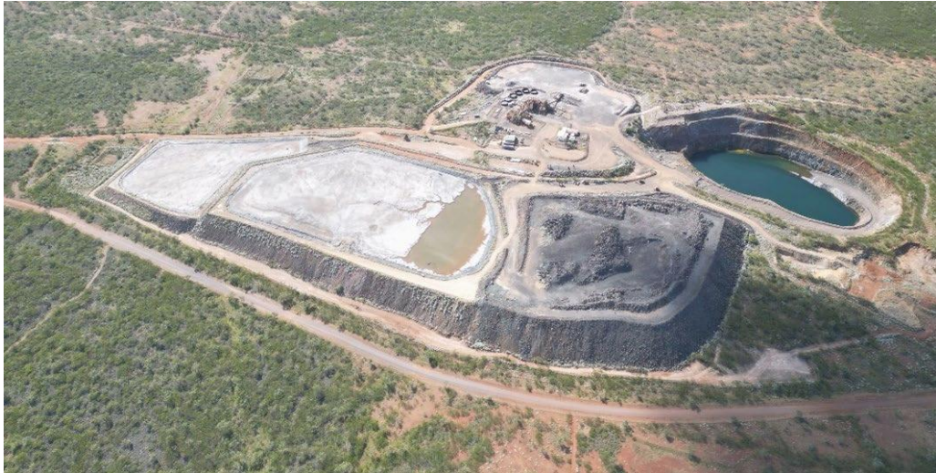
Figure 2 – Overhead of Lorena plant, tailings and waste rock stockpiles and open pit

At the centre of the Cloncurry package is the permitted 280,000tpa Lorena CIL and flotation plant, commissioned in 2018 at a capital cost of more than A$50 million. Independently valued (on a replacement value basis) at over A$30 million recently, the plant was designed for long-term regional use, SAG and ball mills, flotation circuit for sulphidic ores and a four-stage CIL system. It sits only 15km east of Cloncurry on sealed roads with an established water supply, providing the Cloncurry Gold Project with a rare, low-capital cost restart pathway and a potential toll-treating hub for third-party feed.