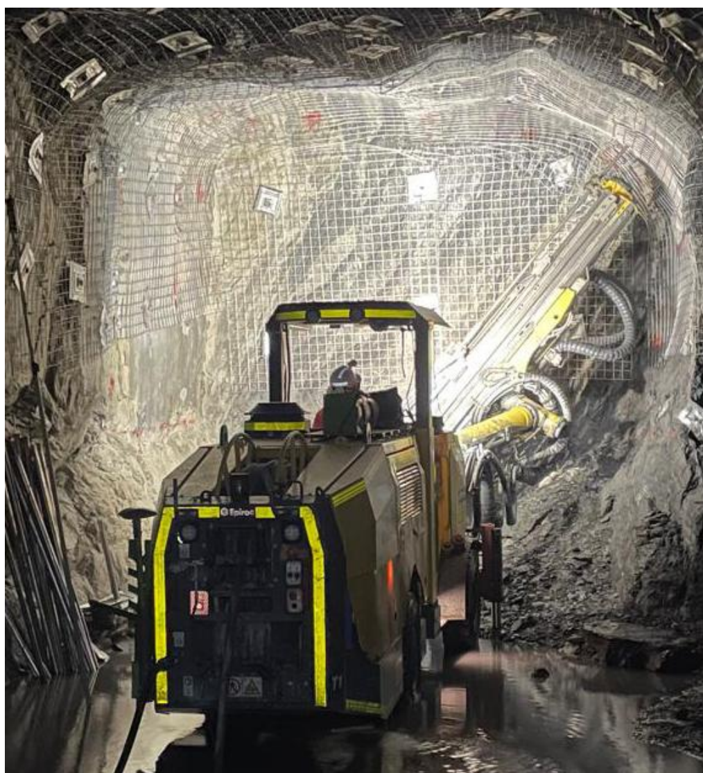
Figure 2 – Jumbo bolting drill cuddy on Lady Belmore Vein.

The Company is employing multiple mining methods to diversify risk and maximise head grade. These include airleg gallery and shrink stoping, jumbo cut and fill stoping and narrow vein longhole open stoping.