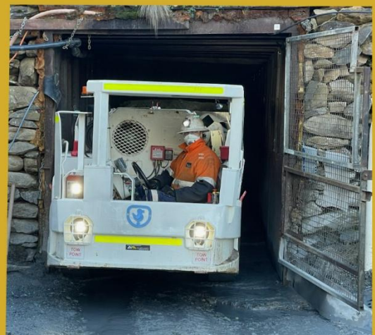
Figure 4 – Truck being loaded with ore and hauled to processing plant.