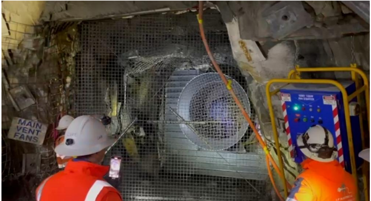
Figure 3 - 110kW primary ventilation starting for the first time on 21 August.