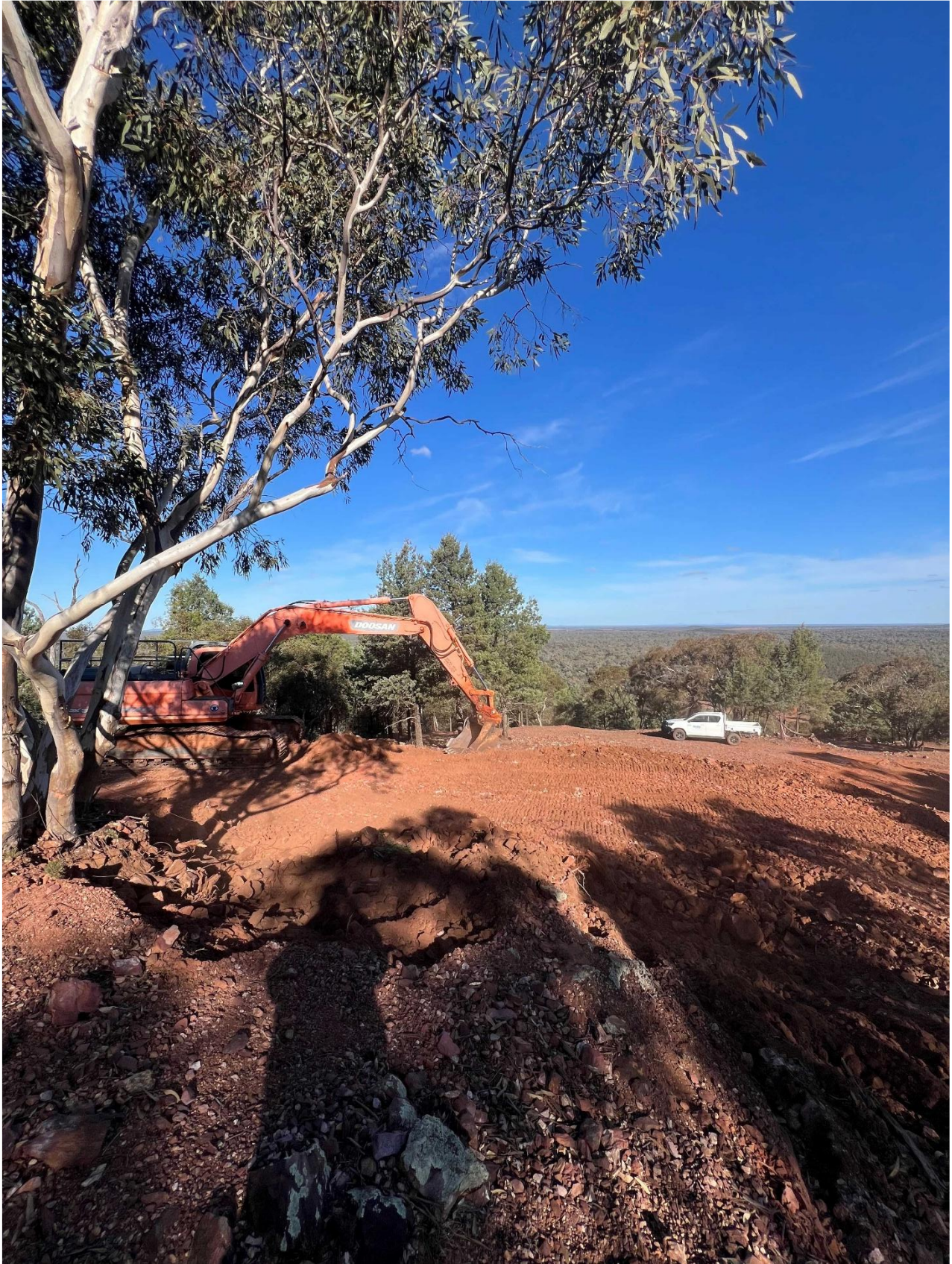
Figure 1: Mt Solitary drill pad/track construction