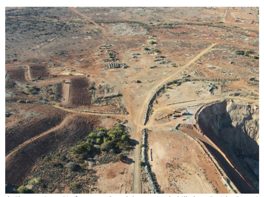
Figure 2 - Existing Lady Shenton Open Pit (foreground) and the unmined, drilled out Pericles Deposit (looking north-west)