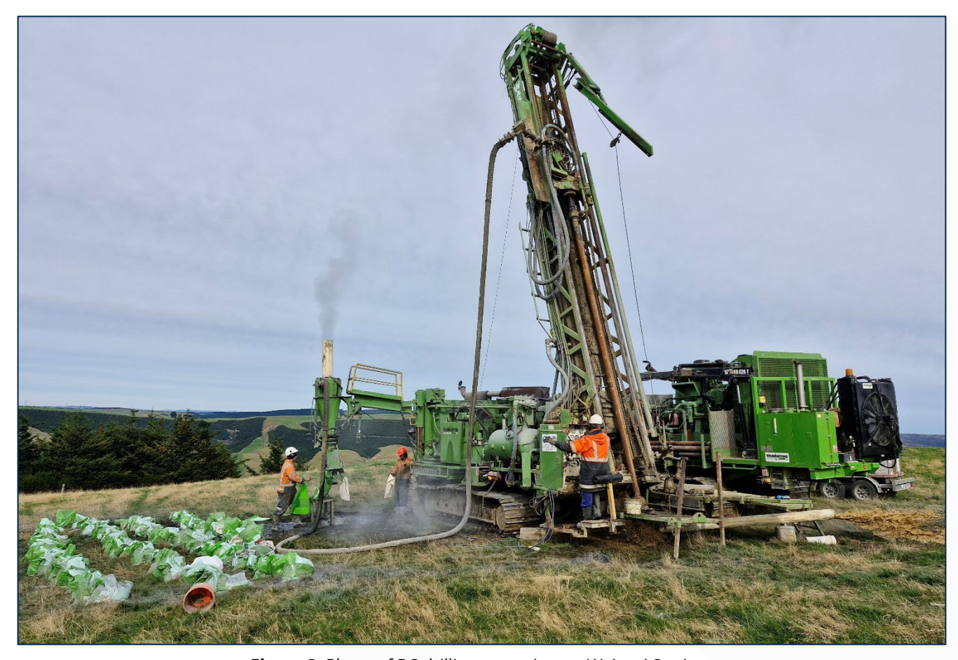
Figure 3: Photo of RC drilling operation on Waipori Station