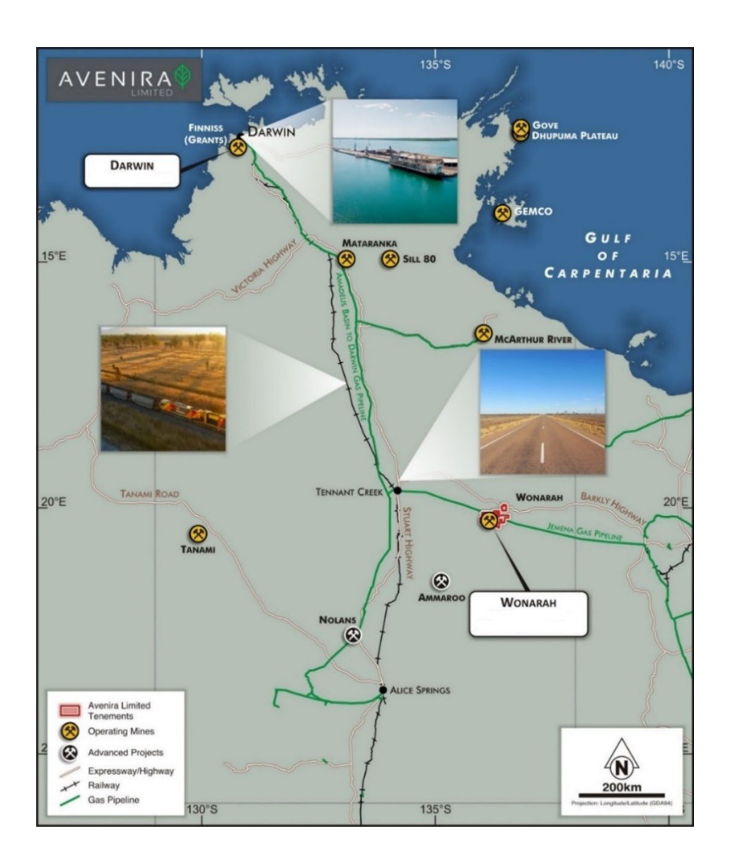
Figure 1: Location map of Wonarah