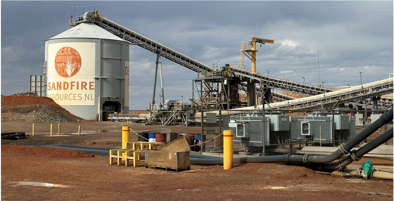
Figure 1: The DeGrussa Processing Plant.