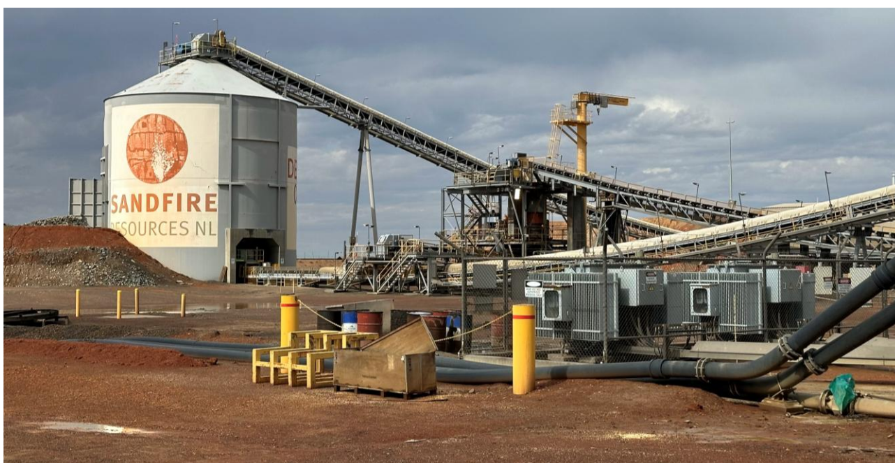
Figure 2: Image of the DeGrussa Processing Plant