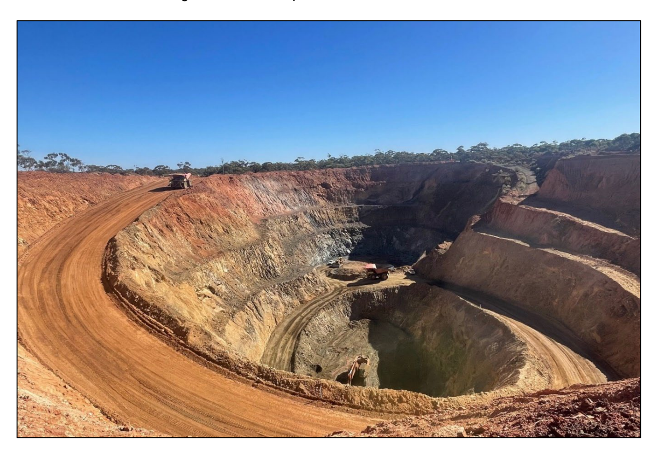
Figure 3: Mining the Newhaven pit at Phillips Find

The additional processing agreement at Three Mile Hill for processing Phillips Find ore has created an additional 80,000 tonnes of processing capacity at the Greenfields mill which can be used for Horizon ore during the June 2025 quarter.