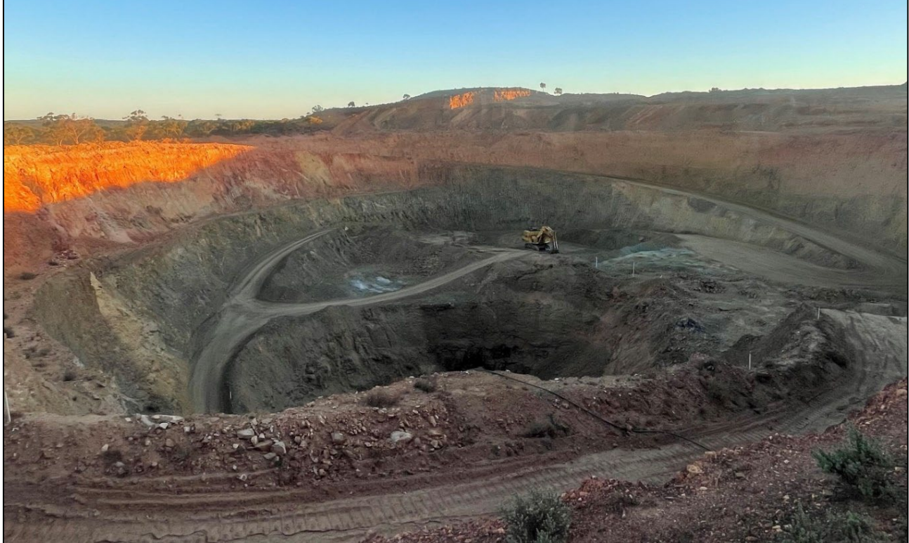
Figure 4: Mining the Newminster pit at Phillips Find