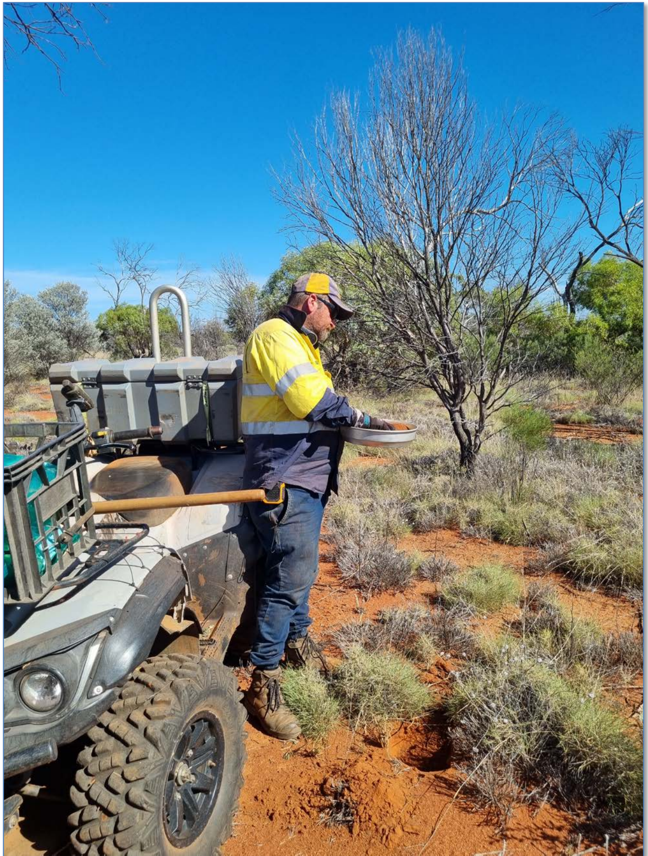
Figure 3 – Soil Geochemistry Sample Collection, Cosmo Project