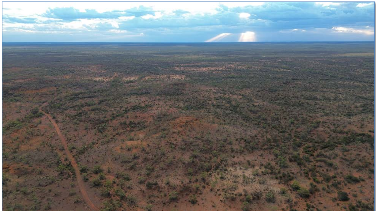
Figure 2 – Aerial View of Cosmo Project Soil Geochemistry Coverage