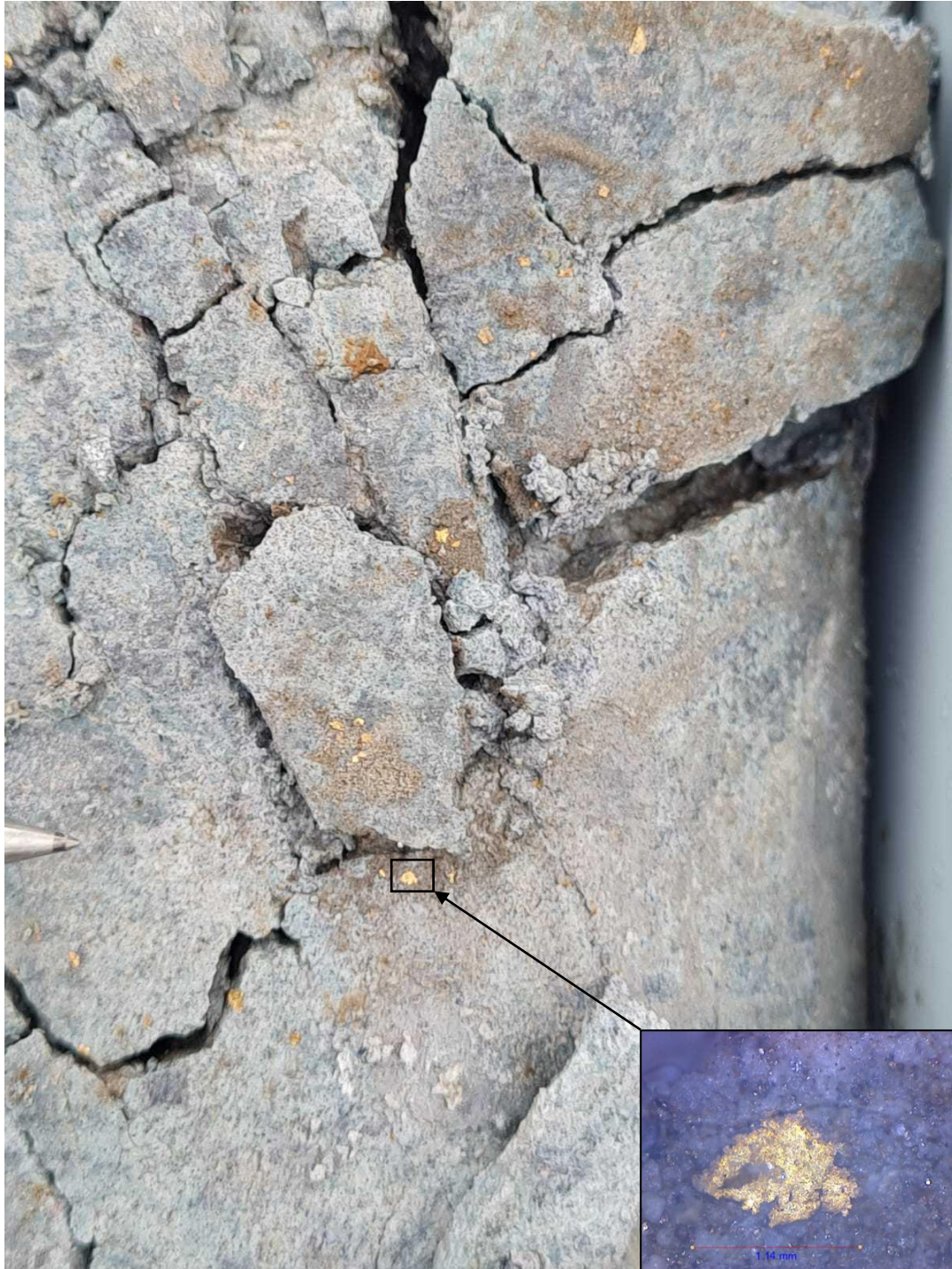
Figure 2 Visible gold identified in diamond drill hole. Drill core has not been sampled or sent for assay. (CDH-62)

To watch a video summary of the announcement click here