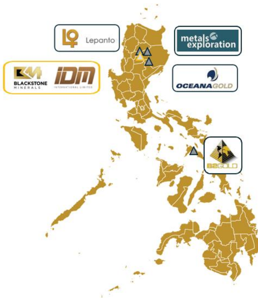
Figure 3 Philippines Mining Operations

Mankayan benefits from its location in the Philippines, a nation with a pro-mining regulatory environment and a long-standing history of successful mining operations (e.g., B2 Gold, OceanaGold). Importantly, the IDM team has materially progressed its social license to operate in Mankayan, ensuring positive relationships with local stakeholders. The Philippines' openness to mining operations, combined with a skilled workforce and existing infrastructure, provides a strong foundation for the project's development.