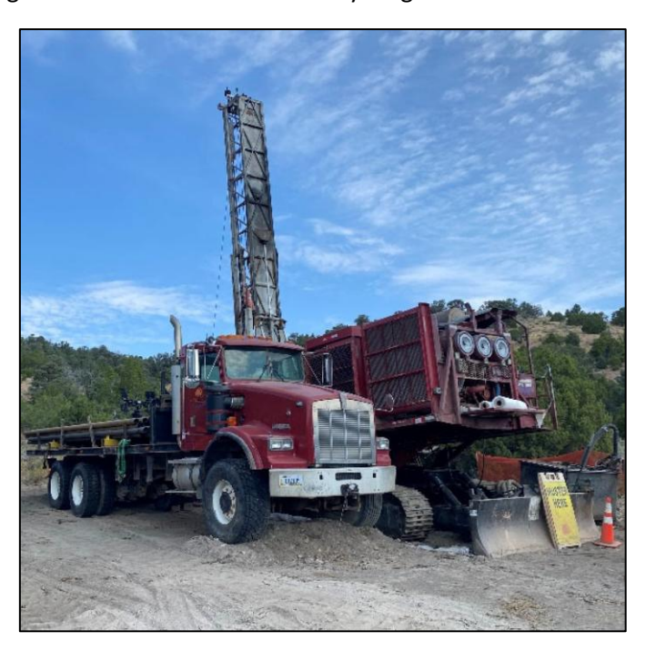
Figure 3: Alford Drilling MPD 1500 drill rig with support truck

Alford Drilling is a Tier One, family owned and operated drilling contractor based out of Elko Nevada. It is well credentialled and referenced and recently signed a contract with Golden Mile's wholly owned Arizona registered subsidiary, Gila Metallica LLC. The Company looks forward to the establishment of a good working relationship with Alford, who is also looking forward to the commencement of drilling operations. The RC rig is available to drill immediately on grant of the above-mentioned permits.