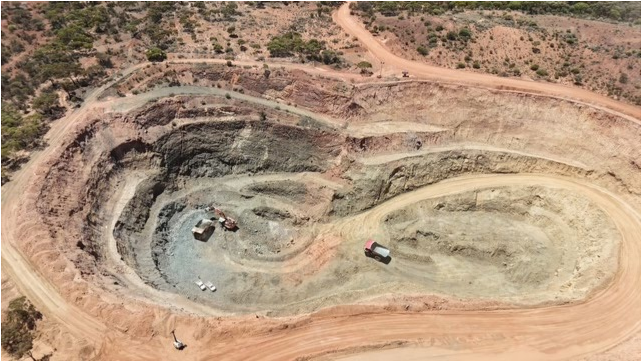
Figure 2: Mining in the Newhaven open pit at Phillips Find