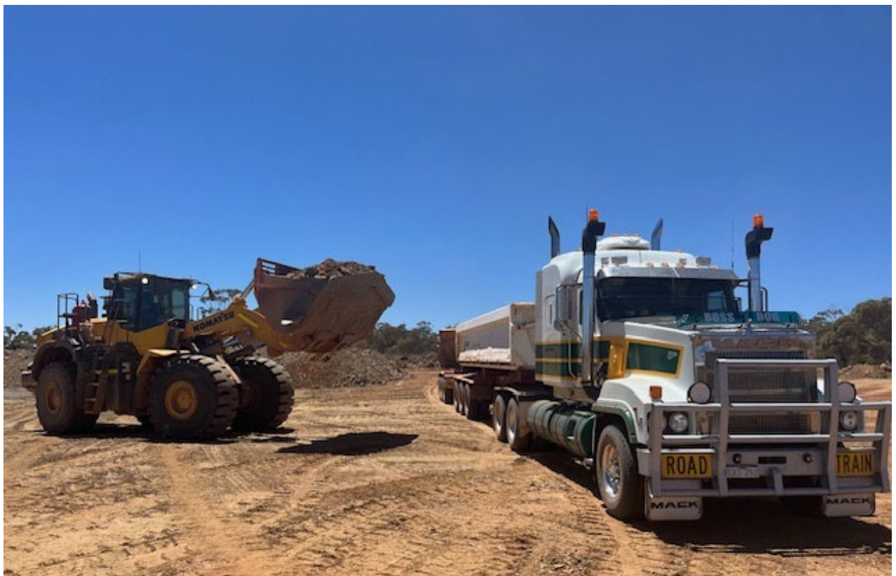
Figure 5: First Phillips Find ore being loaded on route to the Greenfields Mill