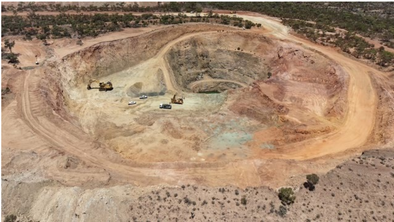
Figure 3: Mining in the Newminster open pit at Phillips Find