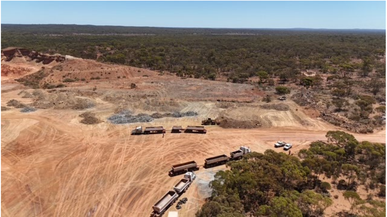
Figure 4: First road trains loading ore