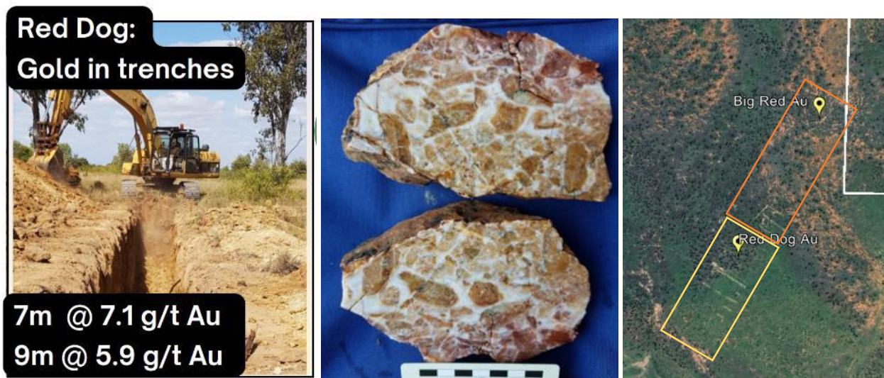
Figure 2: Big Red (Red Dog) Project –Past trenches; quartz breccias; area of past trenches (yellow rectangle) and planned extensions (orange rectangle)

These results produced a drill ready target, but that drill program was delayed twice due to weather and soft ground ( ASX announcement 13 July 2021, 31 April 2022 ). Further trenching is planned to extend the current zone of high-grade gold mineralisation prior to a drilling program over a number of shallow targets. The Company believes the potential of Big Red may be similar to nearby Twin Hills deposit with 1.0Moz (23.1Mt@1.5g/t Au) incl 49m @5.2g/tAu and Lone Sister 0.48Moz (12.5Mt@1.2g/t Au) incl. 28m @45.2g/t Au ( c.f. ASX:GBZ announcement 5 Dec 2022, 28 Apr 2023, 9 Jun 2023 ). No ground exploration was undertaken at the projects during the quarter.