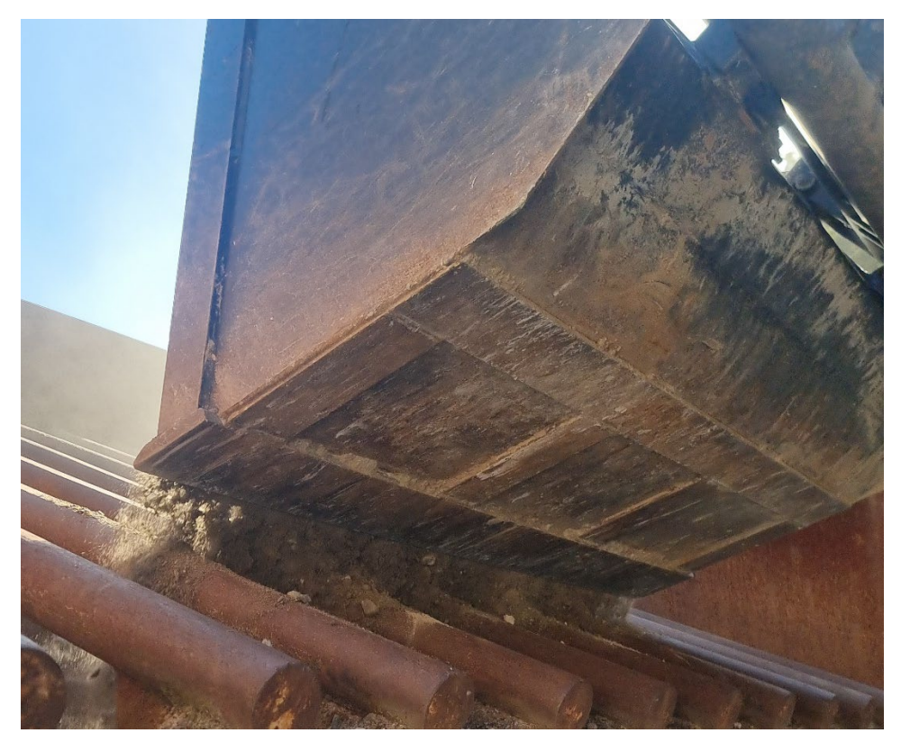
Figure 2 First Ore being tipped into the hopper