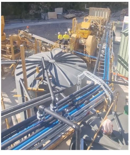
Figure 8 Commissioning team overseeing ore crushing