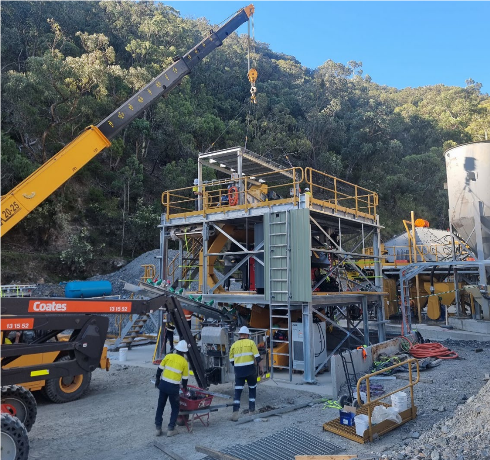
Figure 9 Ore sorter installation well underway