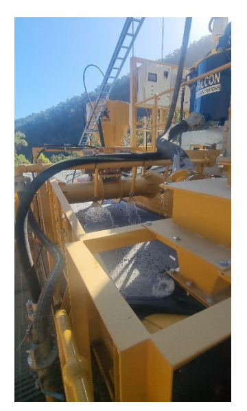
Figure 7 Gravity circuit screen