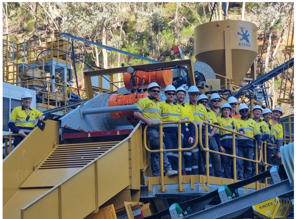
Figure 1 Gekko commissioning and installation team.