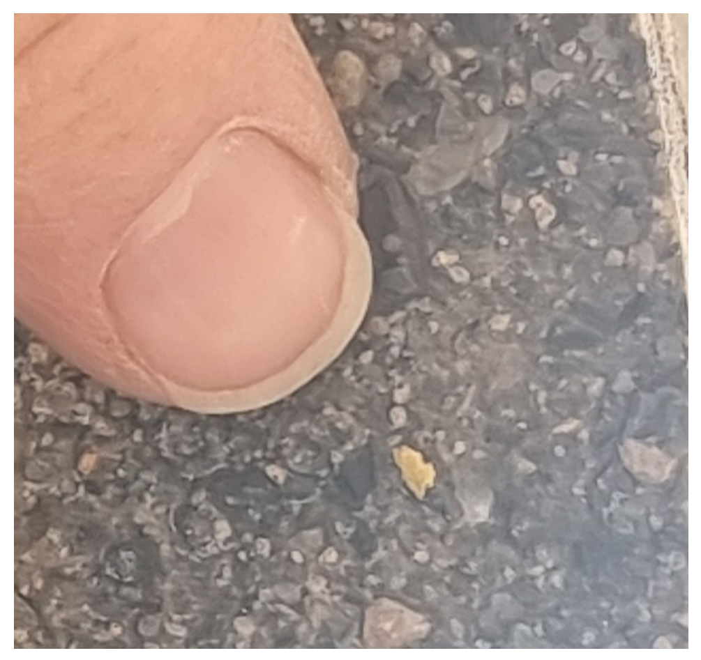
Figure 5 First gold in concentrate before going to the gold room.