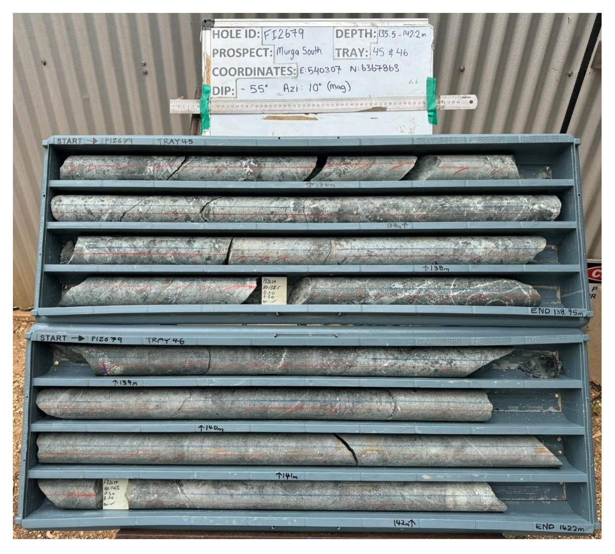
Figure 6: Photo of FI2679 HQ core - 135.9 to 142.2 metres (serpentinised pyroxenite)