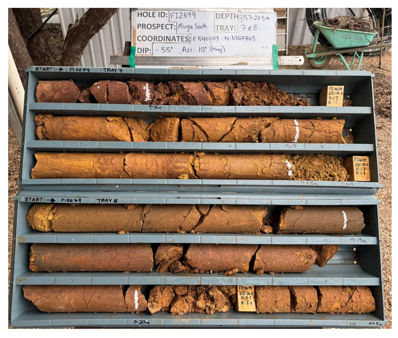
Figure 5: Photo of FI2679 PQ core – 15.7 to 20.5 metres (clay rich laterite)