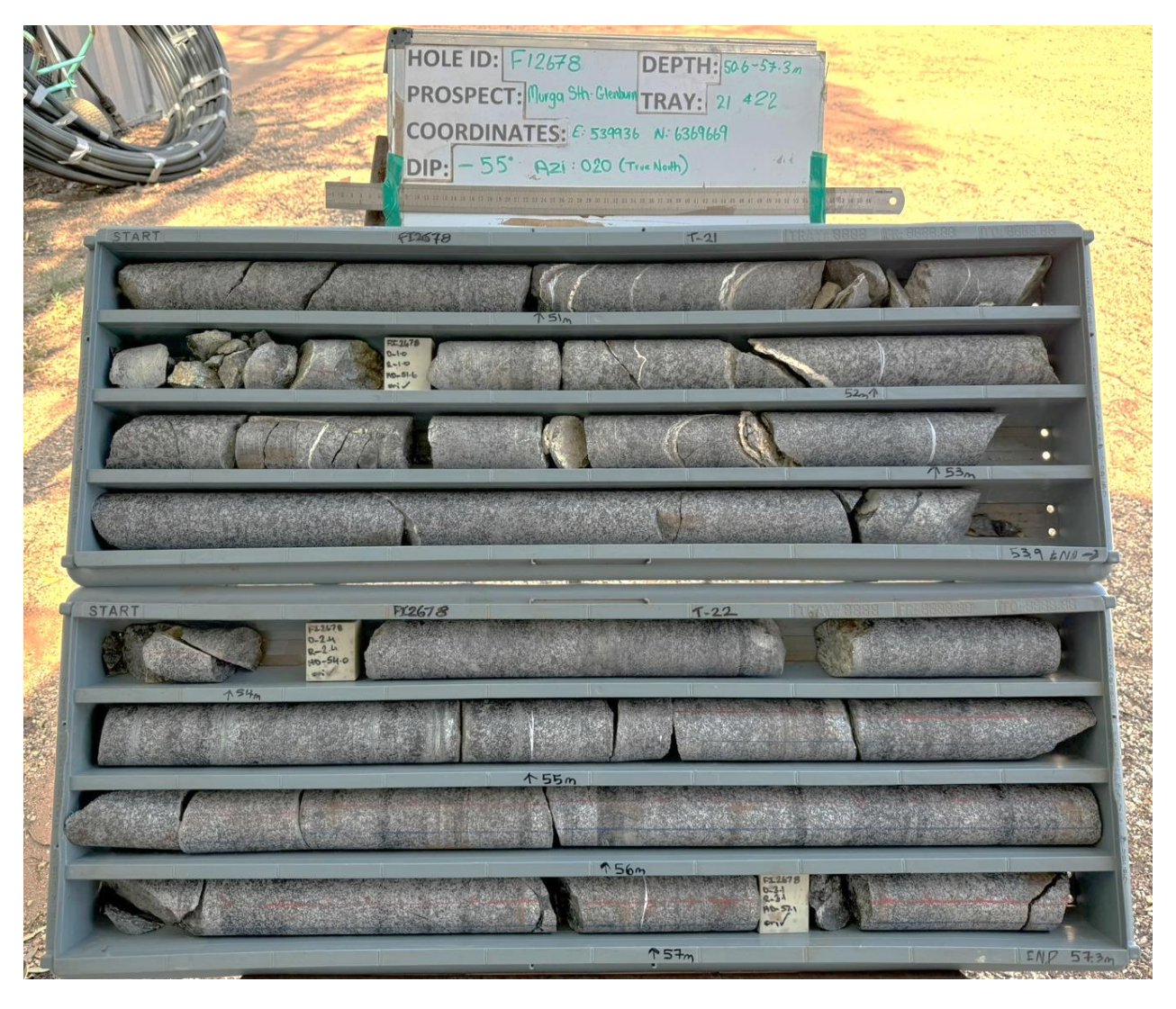
Figure 4: Photo of Fl2678 HQ core - 50.6 to 57.3 metres (coarse grained pyroxenite)