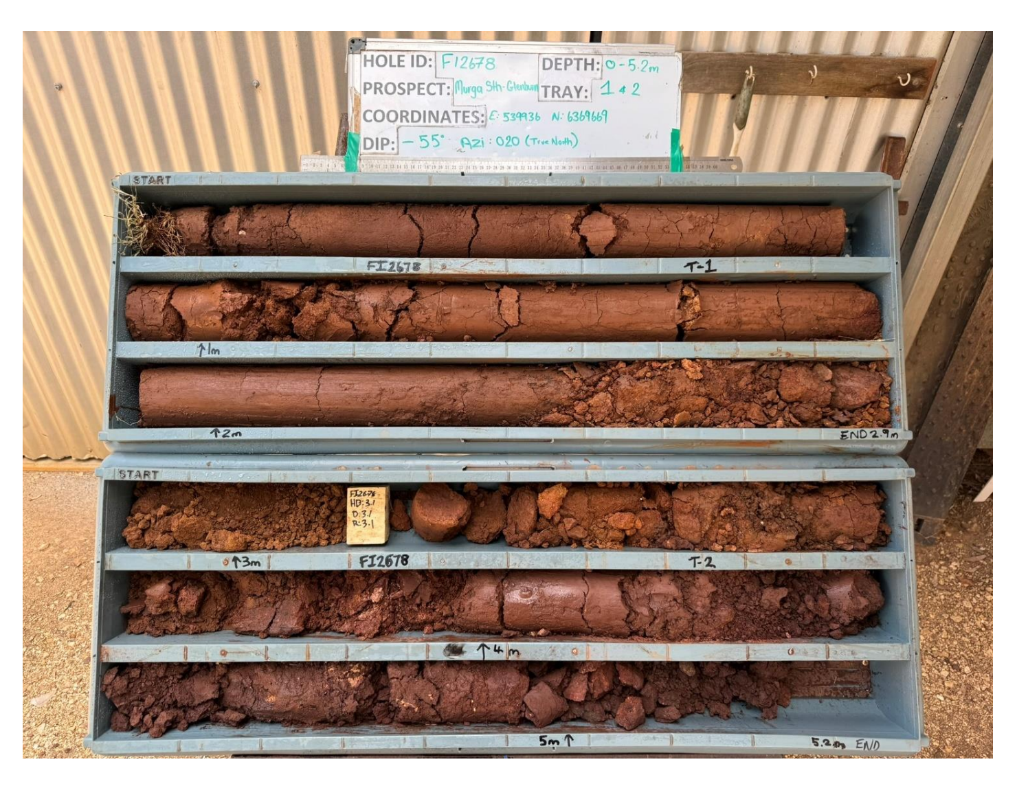
Figure 3: Photo of FI2678 PQ core - 0 to 5.2 metres (clay / laterite)