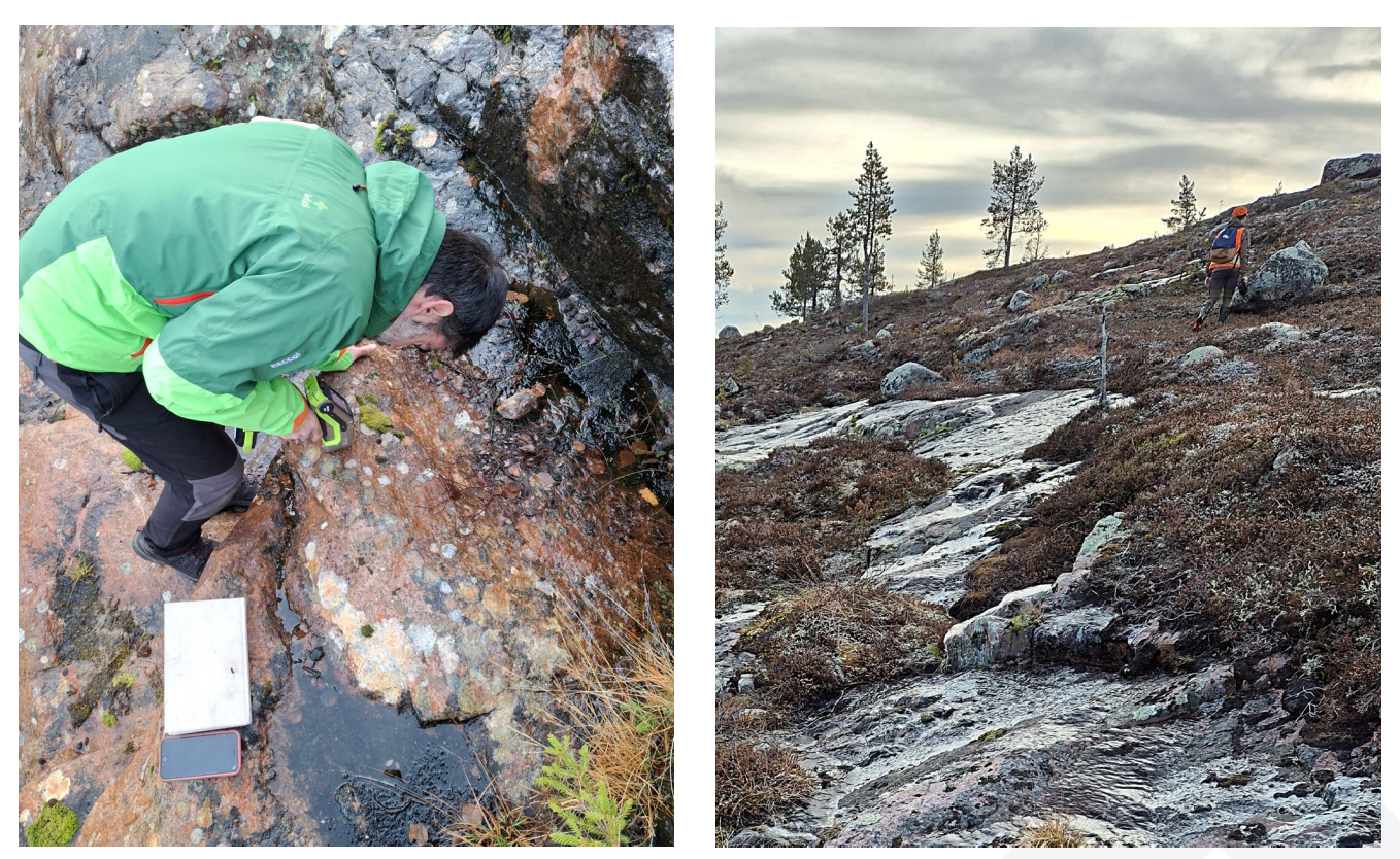
Figure 1: Field team on Basin's projects in the Arjeplog-Arvidsjaur region (Sweden).

These findings have resulted in Basin lodging an additional application to encompass the ground between Bjork and Rava, securing the interpreted extensions of hidden structures (Figure 2). A decision on grant of this permit application is expected in Q1 2025.