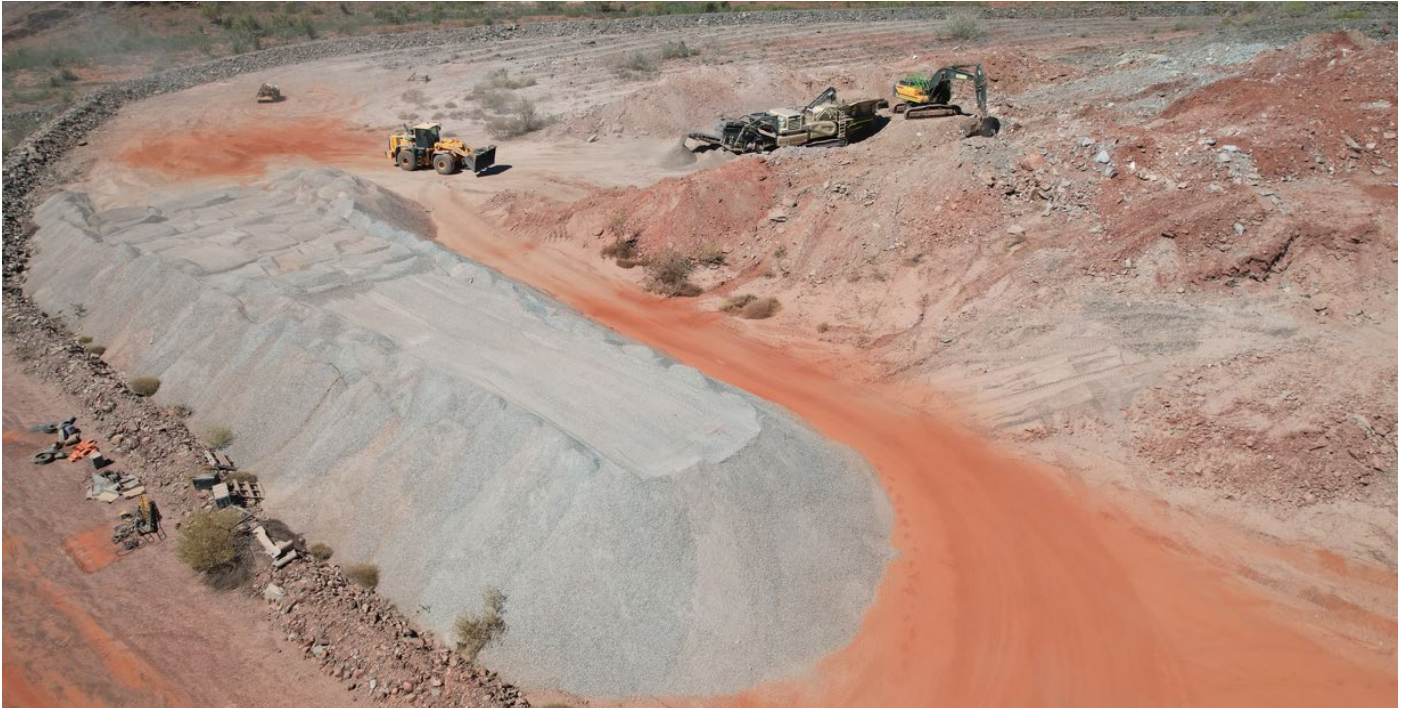
Figure 2: Commercial scale waste rock to road base product trial 1