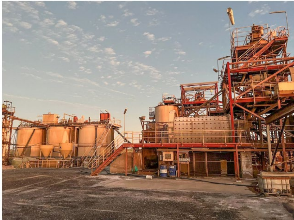
Figure 2 – Lorena Processing Facility

Orion is developing a pathway to re-establish mining and processing operations at the Cloncurry project with a focus on restarting mining at the Mt Freda/Golden Mile deposits. As part of its recommencement strategy, Orion’s immediate focus is summarised below.