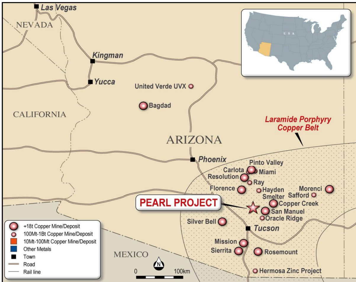
Figure 3: Major resource projects within Arizona, USA.

Despite prolific evidence of surface mineralisation and its location being immediately north of BHP’s San Manuel-Kalamazoo Mine, one of the largest deposits in the Laramide Porphyry Copper Province, the Project has been subject to minimal modern exploration and has never been drilled.