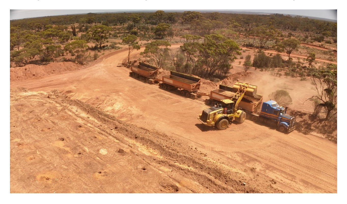
Figure 3: First Boorara ore being loaded on route to Paddington Mill