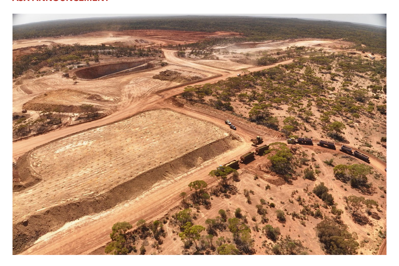
Figure 2: First road trains loading ore with open pit operations in the background