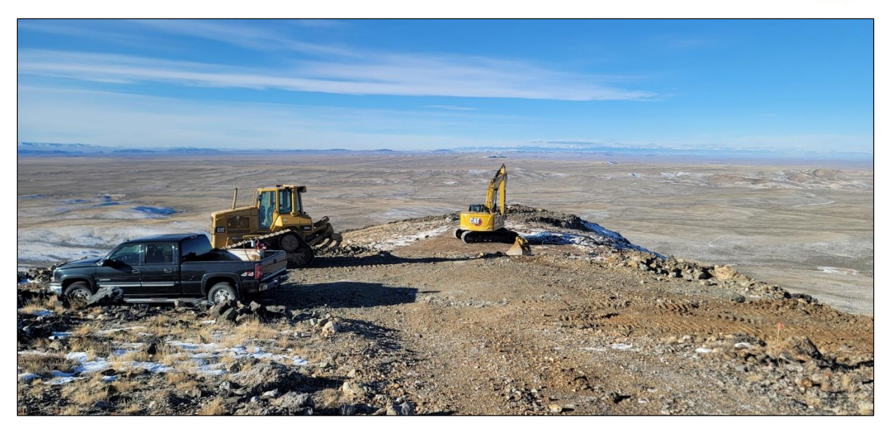
Figure 2: Road and Drill Pad Construction at Black Mountain