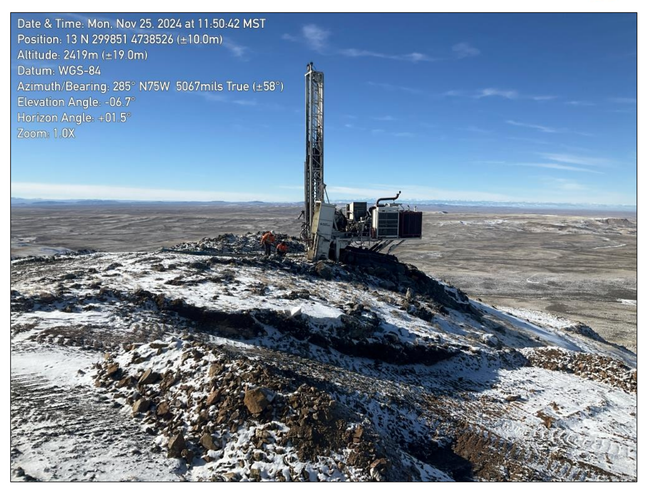
Figure 1: Boart Longyear MPD 1500 Reverse Circulation Drill Rig at Black Mountain