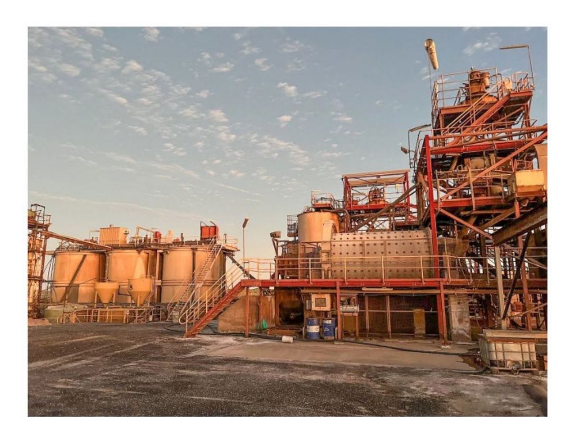
Figure 3 – Lorena Processing Facility