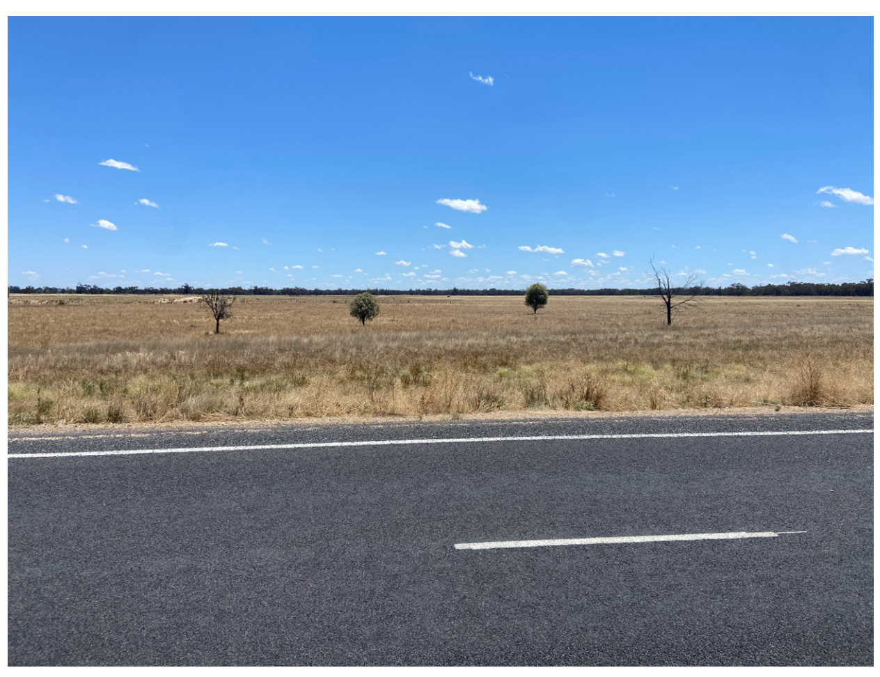
Figure 5: Photo taken in vicinity of the Malamute prospect showing typical countryside