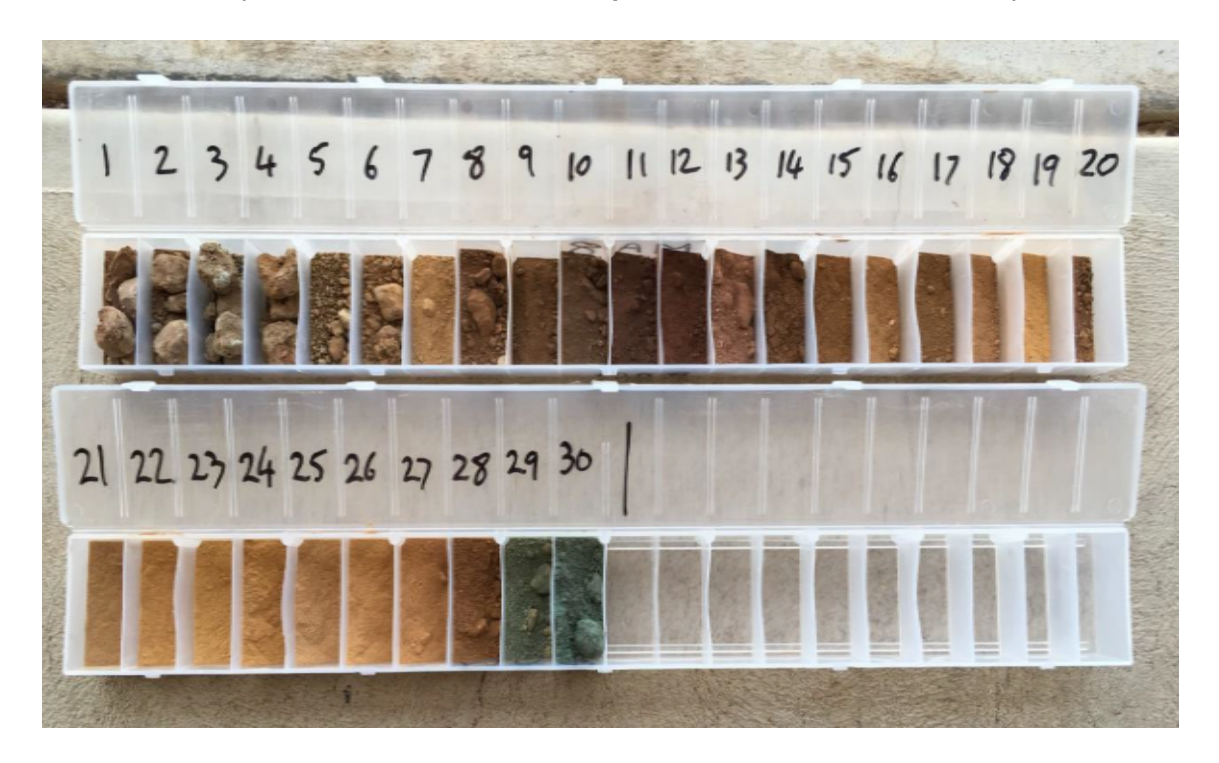
Figure 3: Chip tray for air core drill hole MA08 which intersected 9m @ 197ppm Sc from 8 metres including 3m @ 272ppm Sc from 13 metres. Numbers 1 - 30 on the chip tray denote individual downhole intervals (i.e., "10" means the drill sample obtained from 9 – 10 metres).