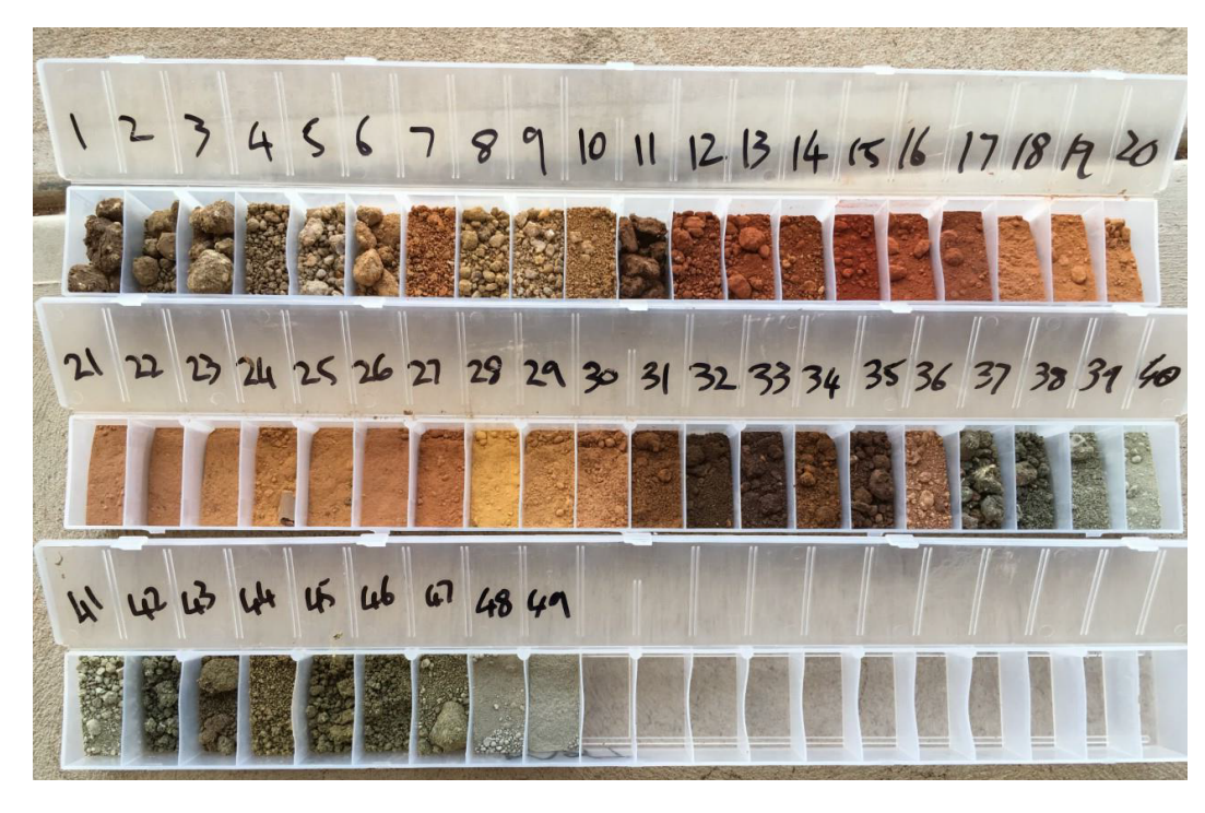
Figure 2: Chip tray for air core drill hole MA07 which intersected 18m @ 217ppm Sc from 30 metres including 6m @ 331ppm Sc from 31 metres. Numbers 1 - 49 on the chip tray denote individual downhole intervals (i.e., "10" means the drill sample obtained from 9 - 10 metres).