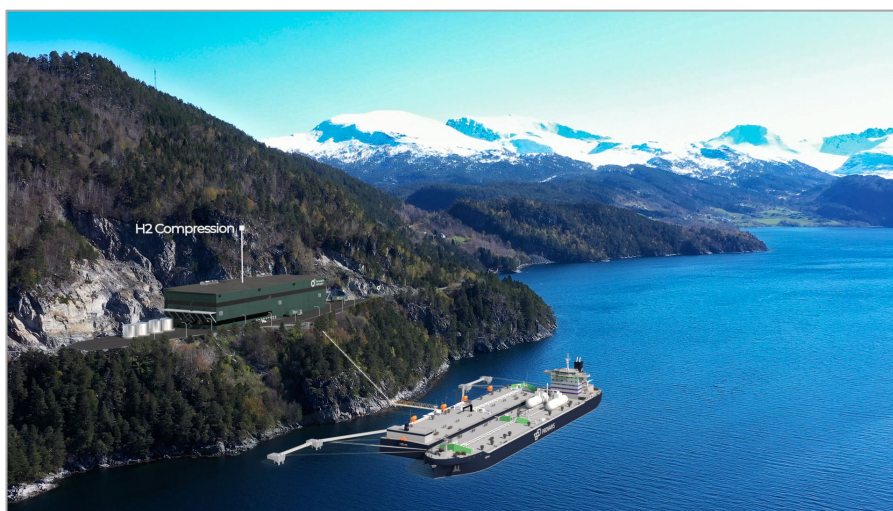
Illustration of the proposed Project Site at Ørskog illustrating Storage, Loading and Export Terminal utilising Provaris' H2Leo™ barge storage and H2Neo™ carrier