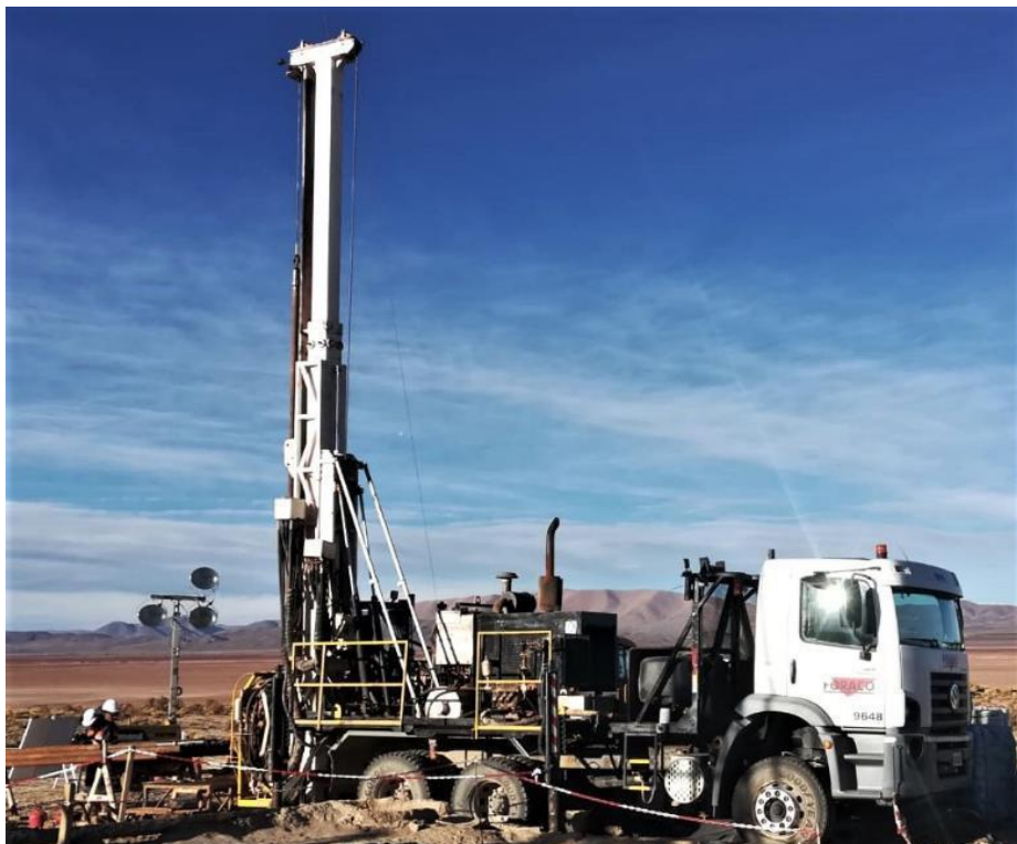
Figure 1: Foraco diamond drill rig at Cauchari looking across salt lake to Ganfeng/Lithium Americas project