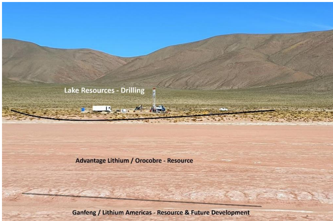
Figure 2: Location of LKE's drill operations at Cauchari in relation to Advantage Lithium/Orocobre & Gangfeng/Lithium Americas leases. (Note: The marked boundaries are indicative only. Please refer to the detailed map).